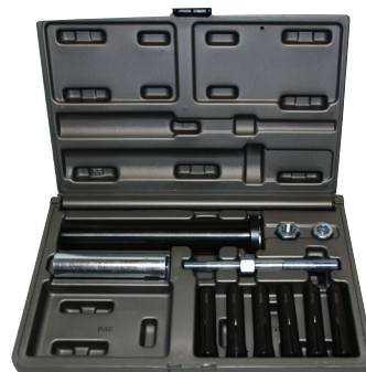
952-900 BLOW MOLD CASE