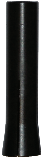
953-280 COLLET 4MM