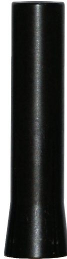
953-290 COLLET 5MM