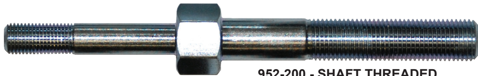
952-200 - SHAFT THREADED