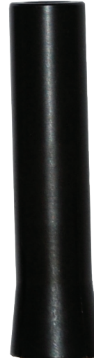
953-260 COLLET 12MM