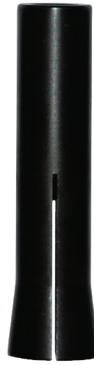
953-240 COLLET 10MM