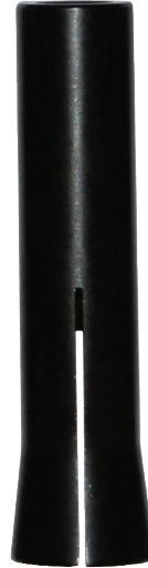
953-220 COLLET 8MM