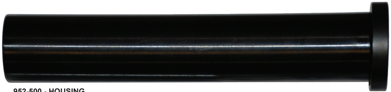
952-500 - HOUSING